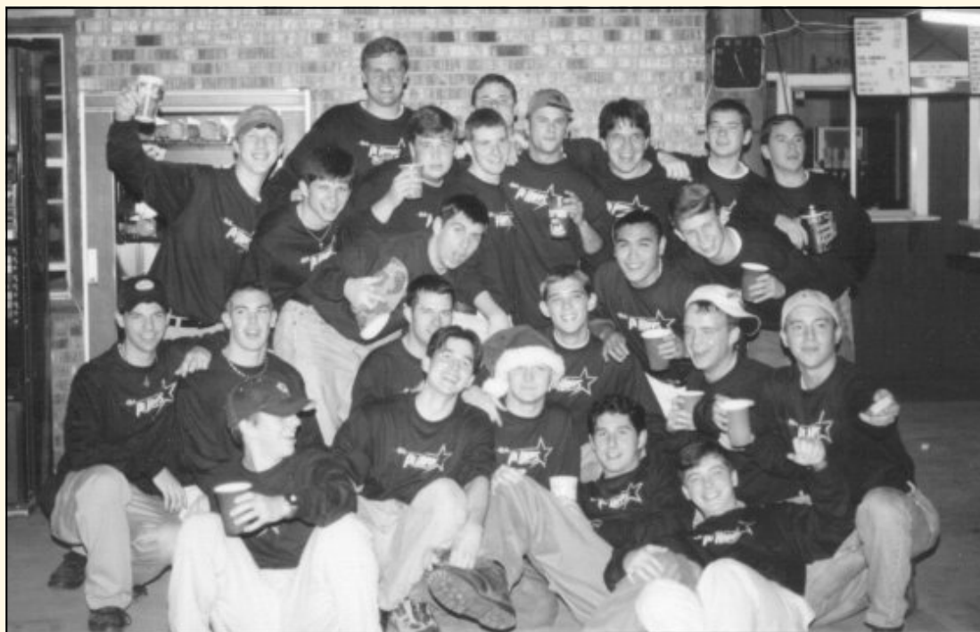
Photo from the first Hook-a-Brother-Up date party at Pep's Point Water Park