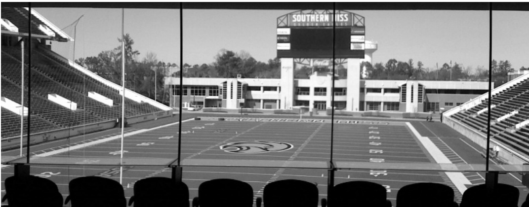
Photo above taken from the second story of M.M. Roberts Stadium's Touchdown Club , site of the banquet.

Come join your chapter brothers, friends and families for the 10th Anniversary Celebration of the Theta Alpha Chapter! Anniversary festivities will begin Friday evening, April 24 and continue all day Saturday April 25.